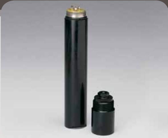
CT-6A Sensor Probe