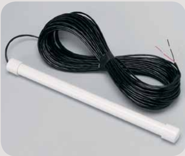
CT-6 Sensor Probe