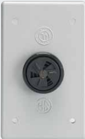
CT-11 Outdoor Sounder