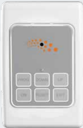
CT-A1 Indoor Sounder