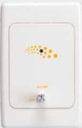
AA-1 Alarm Alert